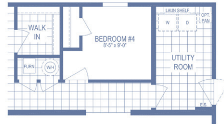
OPTIONAL 4th BEDROOM

3 beds | 2 baths | 1,620 sq. ft. | 28x60