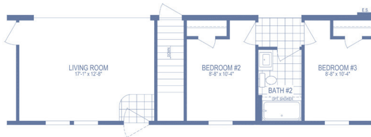
OPTIONAL BASEMENT STAIRWELL